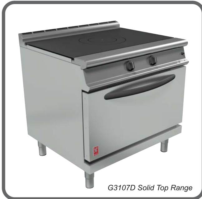
G3107D Solid Top Range